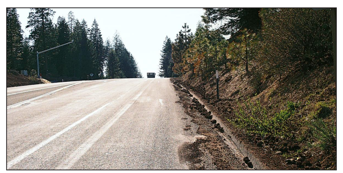
Photo 9. View from SR 299 looking west toward Bunchgrass Lookout Road. Topography and vegetation confine views to the foreground. The project area is not visible.