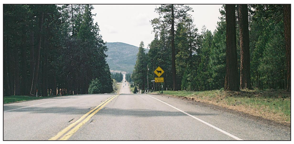
Photo 12. View from SR 299 looking west toward the project area. A narrow portion of the project area is visible in the middleground, but vegetation confines views to the roadway corridor. The beginning of the grade to Hatchet Ridge Summit is visible at the base of the ridge.