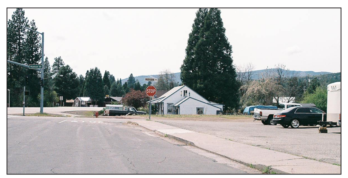
Photo 3. View from a frontage road along Main Street looking toward Hudson Street in Burney. The project area is visible, but infrastructure such as utility lines, poles, and buildings are elements that obscure views.