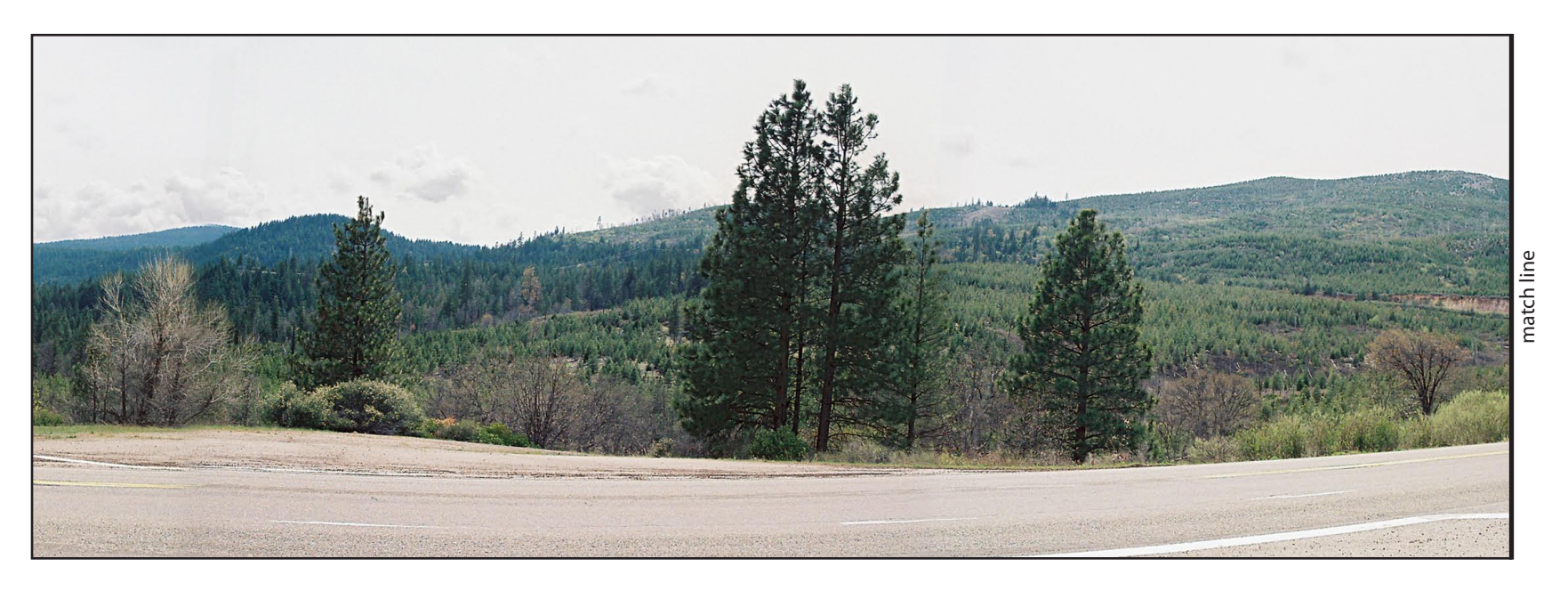
Photo 13. View from SR 299 and a logging road intersection, west of Ivan Marx Road, looking west toward the project area. Note the winding roadway corridor and post-fire forest regrowth on Hatchet Mountain.