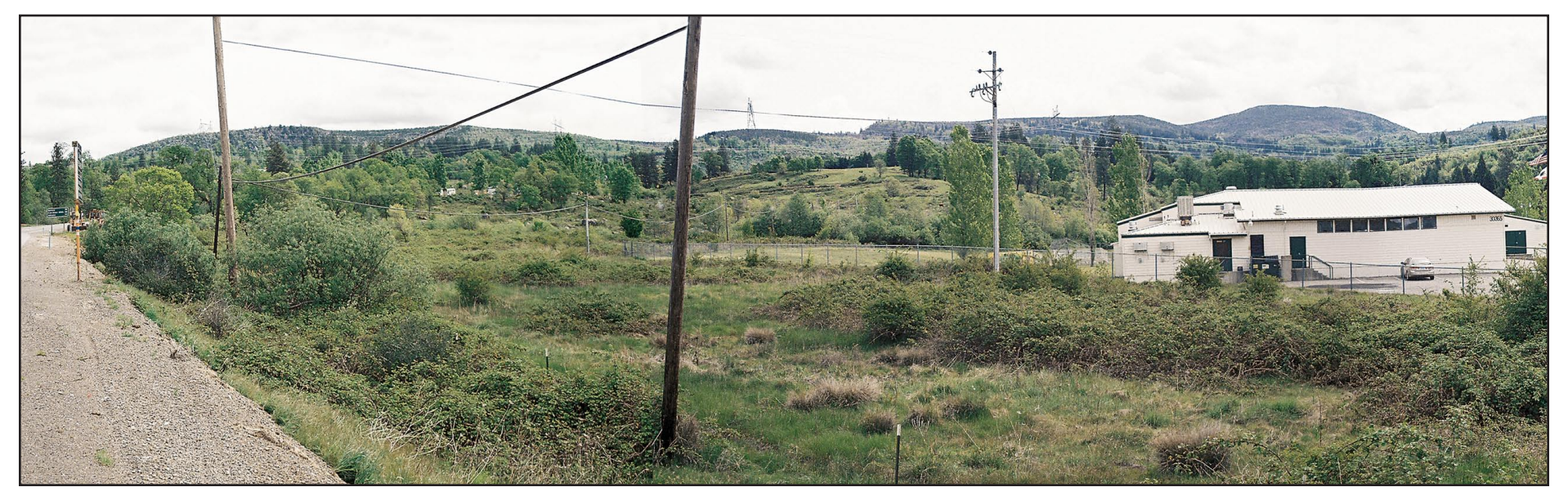
Photo 2. View from Montgomery Creek. Topography confines views to the foreground; the project area is not visible.