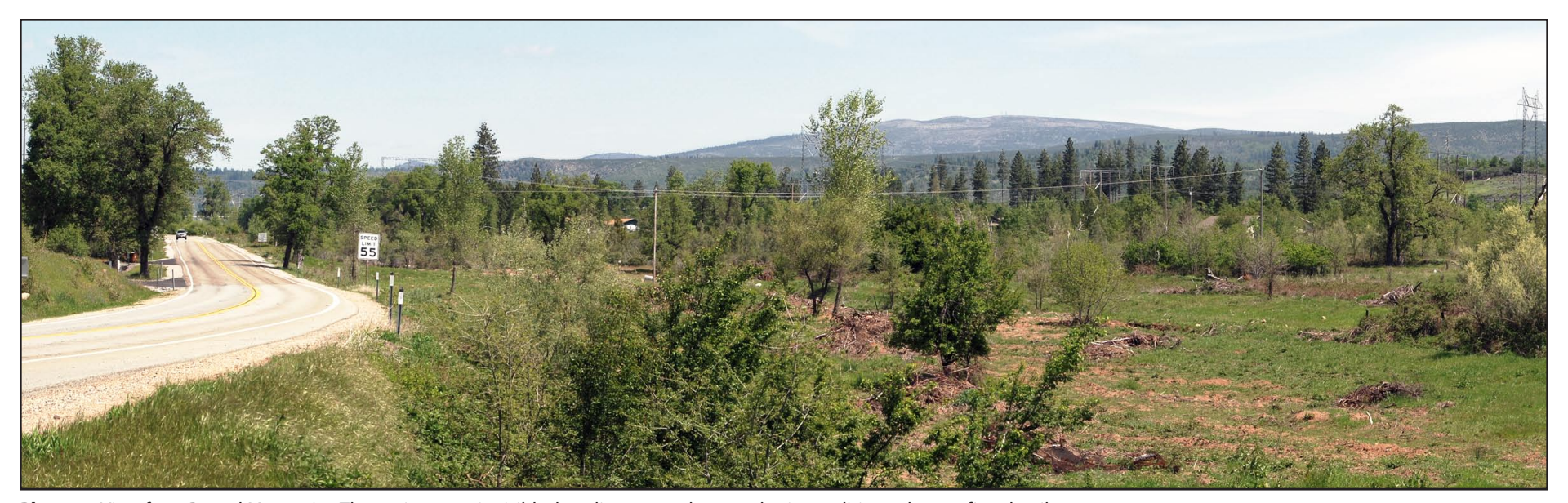
Photo 1. View from Round Mountain. The project area is visible, but distance and atmospheric conditions obscure fine details.