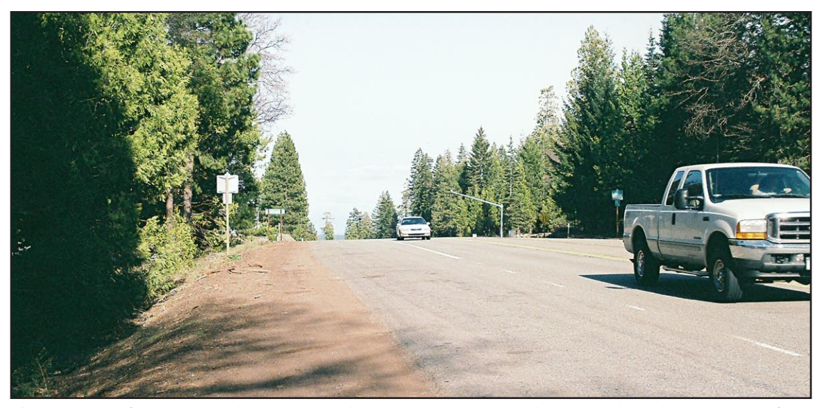
Photo 10. View from SR 299 looking east toward Bunchgrass Lookout Road. Topography and vegetation confine views to the foreground. The project area is not visible.