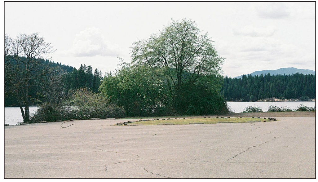
Photos 8a (top) and 8b (above). Views from near Lake Britton at McArthur-Burney Falls Memorial State Park. Topography and vegetation confine views to the foreground and middleground. The project area is not visible.