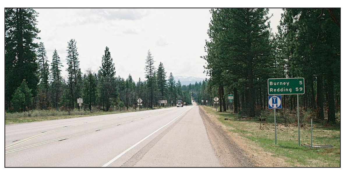
Photo 11. View from SR 299 looking west toward Burney. Topography and vegetation confine views to the roadway corridor. The project area is faintly visible in the background.