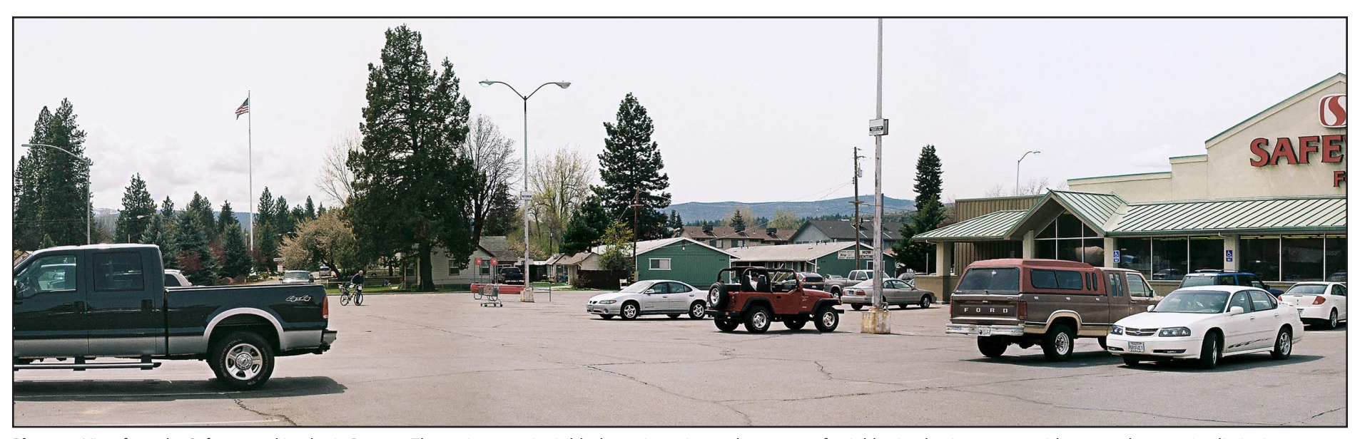
Photo 5. View from the Safeway parking lot in Burney. The project area is visible, but orientation and presence of neighboring businesses or residences and vegetation limit views.