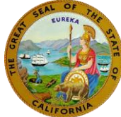
EDMUND G. BROWN JR. GOVERNOR